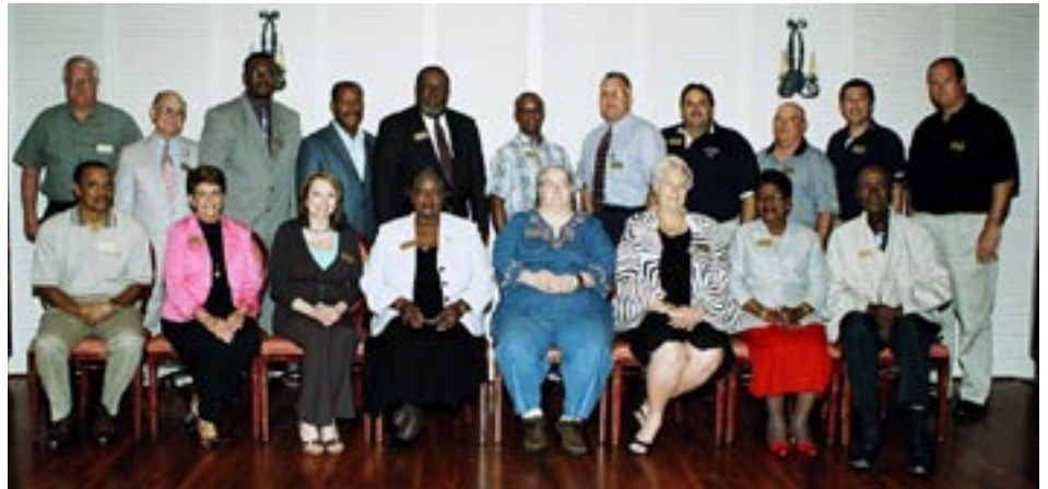
Members of the Motiva Advisory Panel

The committee is a direct link between the community and company to provide an opportunity to discuss issues that may be of interest/concern within the community. The refinery works to address the feedback from the panel to ensure continued strong environmental and safety performance giving the highest concern to the community and employees of PAR.