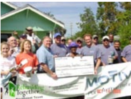
Motiva Crude Expansion Project Team donates $2,000 to the Rebuilding Together Organization

Thank You to the following Volunteers that participated in the successful day-long Rebuilding Together Project.